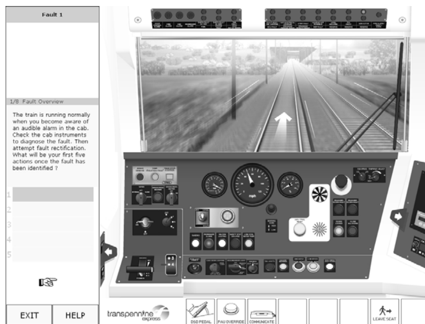
Fig. 12. First TransPennine Express Computer Based Training (Simulation based)

CBT, enhancing their overall underpinning knowledge of the trains.