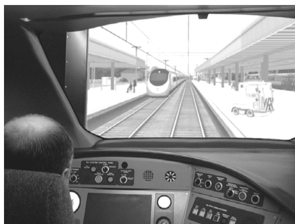
Fig. 7. Simulator used for training in low frequency – high risk situations

When new rolling stock, new signalling systems or new operational procedures are introduced in operation, the simulator enables the drivers and the other staff categories to become familiar with the new equipment and procedures before they are effectively introduced, reducing the both the learning curve and the roll-out time and, consequently, reducing the associated costs and risks.