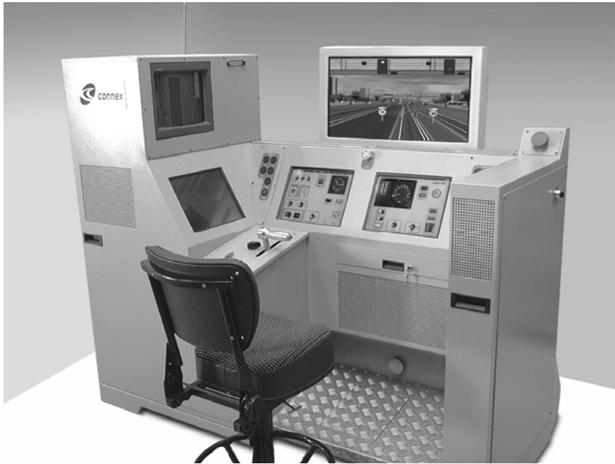
Fig. 3. Example of a multifunctional simulator

realism is created via the screen and through linked sound, this, in many cases, is not seen as a great loss. Multiple networked simulators frequently fall in this category. Multifunctional simulators can also easily be made into mobile units by installation of 2 or more simulators into an articulated truck trailer. Using of removable hardware panels with control equipment and specific content on the screens give the possibility to have various types of rolling stock on the same simulator.