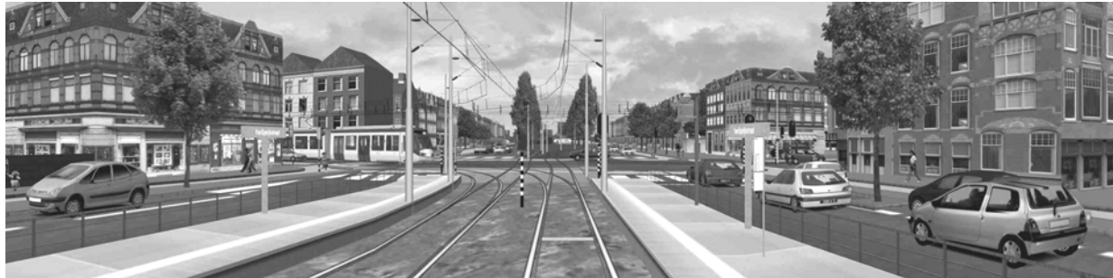
Fig. 9. Simulator enables to create an identical training scenario for all drivers