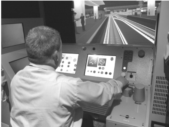
Fig. 11. Southern have networked their simulators between Selhurst and Worthing

BNSF Railway in the USA, one of the world's largest freight operators with over 8000 drivers and over 15 years experience of simulators, has decentralised their central Kansas City training centre to deploy over 40 simulators at locations all over the United States with the management and control performed centrally from Kansas City. Likewise Union Pacific have moved away from a central training centre at Salt Lake City and have distributed over 35 simulators out in the field.