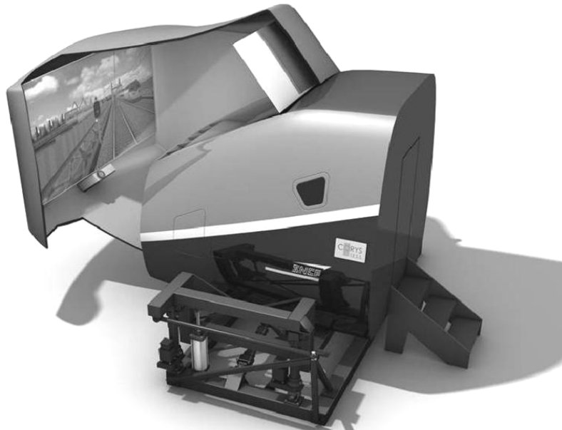
Fig. 1. General view of a full scope cab replica simulator on a motion base

Graphical instructor stations enable numerous train and/or track borne and procedural defects to be simulated with observer stations allowing groups of drivers to follow the running and debriefing of a simulated exercise.