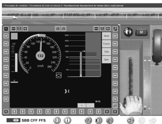
Fig. 10. Login Simulator (Switzerland) enables the familiarisation with ERTMS

The progressive building of the European network, the specific and complex issues related to interoperability, progressive unification of railway systems, ERTMS, cross-border operations etc. create new requirements for driver training and for training simulators which will have to be able to address all these issues.