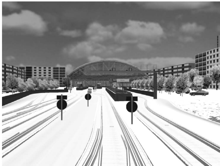
Fig. 6. Simulation of snow on track with Computer Generated Images

Driving in low adhesion and adverse climatic conditions (rain, snow, ice, autumn leaves on rails, heavy fog etc.) is a real challenge for rail operators and drivers. With the simulator, such conditions can be easily created and the driving techniques taught in a fully safe environment.