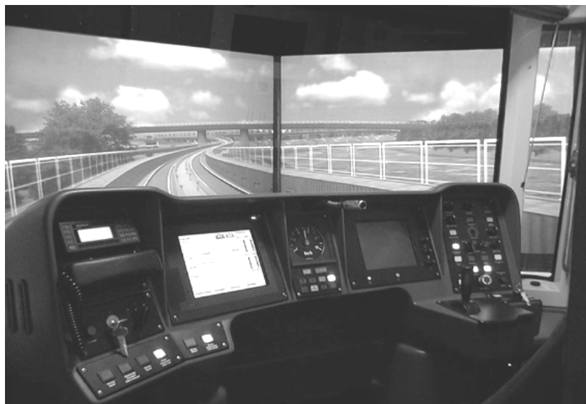
Fig. 2. The cab interior and projection system of a metro full scope simulator