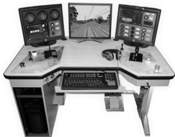
Fig. 4. Example of a compact simulator

faults and incidents. This type of simulator struggles to create the atmosphere of real cab simulators.